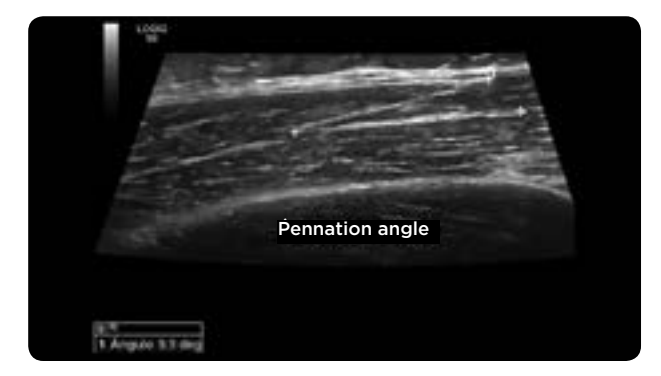
Figure 3. Pennation angle: angle between the orientation of the fascicle and its junction with the axis of the tendon.

This structural change of muscular atrophy suggests a process of chronic evolution, and its relation with the decrease of the angle of pennation has been previously described (23,24), as well as the relation of the angle of pennation and the generation of force in the muscle, bearing in mind that the mechanisms generating force in the muscle are strongly influenced by factors of the muscular architecture, which could explain the weakness in the proximal musculature of these patients (25). Atrophy in patients with SLE has also been described by means of histopathological studies, as mentioned by Jakati and collaborators, who evaluated the findings found in 15 muscle biopsies performed on patients with SLE diagnosis and muscle symptoms, with predominant characteristic of atrophy type II in 13 of 15 patients (86.6 %), defined as the type of muscle atrophy in the absence of inflammatory changes (18).