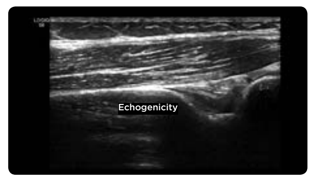
Figure 4. Muscular echogenicity: property of the muscle to generate reflection of ultrasonic waves, its alteration is evaluated in relation to the bone echo.

tomatic patients and to the lack of evaluation of qualitative parameters, especially of muscular echogenicity.