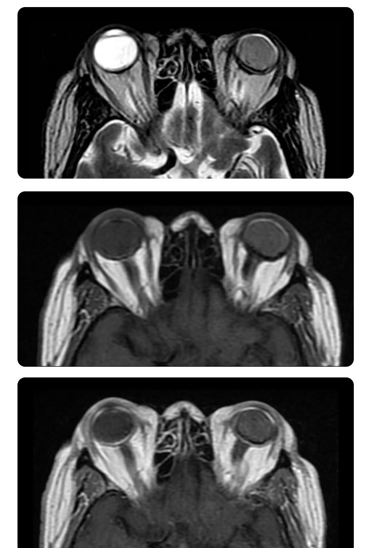
Figure 1. a) Axial MRI with T2 information: bilateral choroidal thickening; alteration in the morphology and in the signal of the left eyeball, decrease in size, due to old changes of detachment of the left retina and surgical absence of the crystalline lens. Phakectomy with intraocular lens in the right orbit. (b) MRI with T1 information and (c) with contrast medium: bilateral choroidal thickening and enhancement.